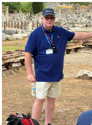
At Paul's Bema in Berea